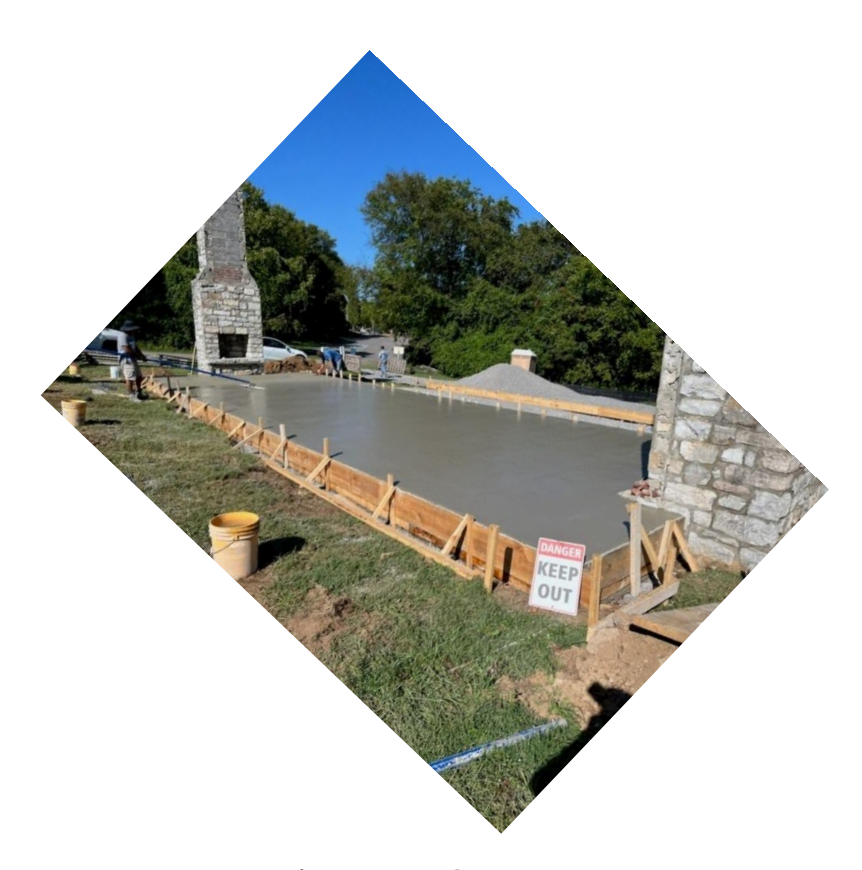
Foundation Poured September 2024