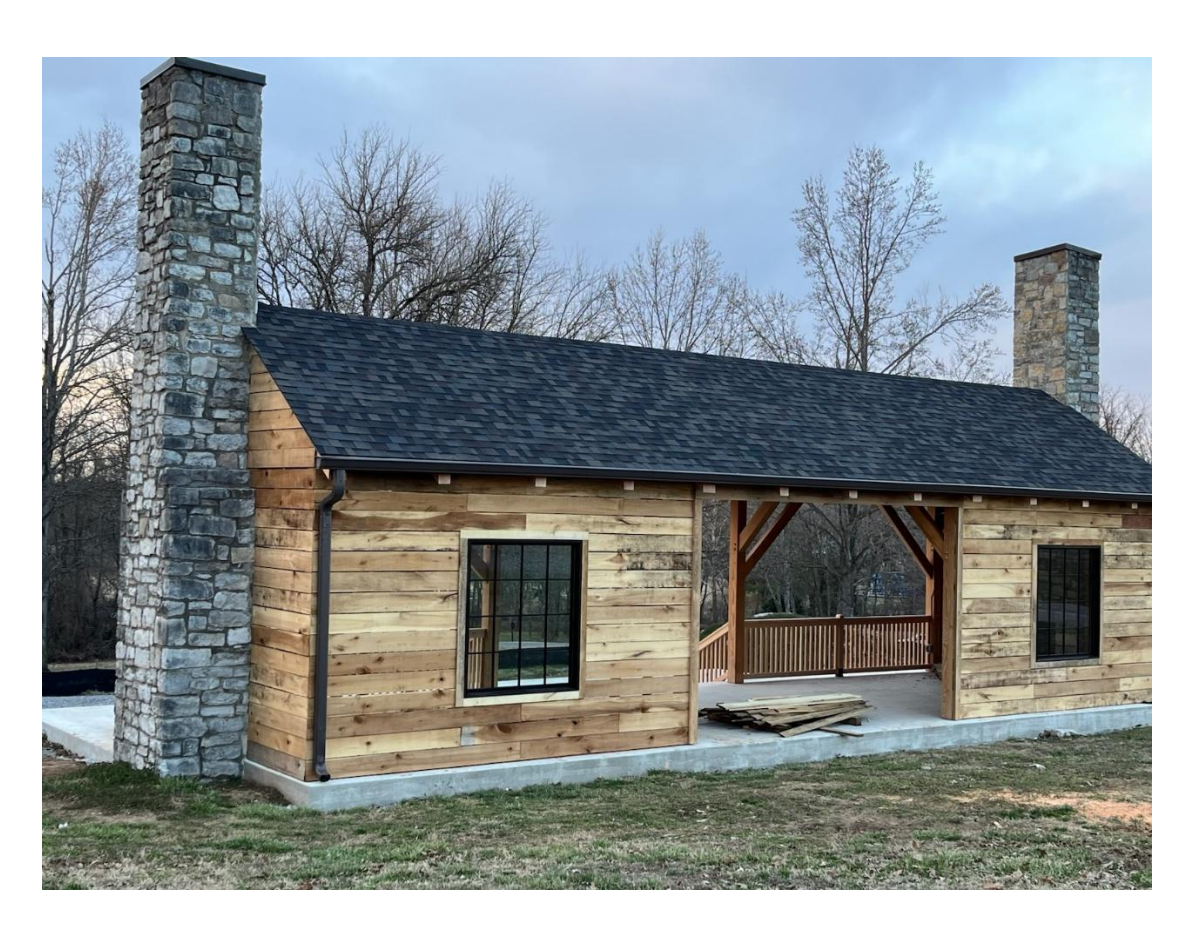
Windows and Trim Installed, February 26, 2025