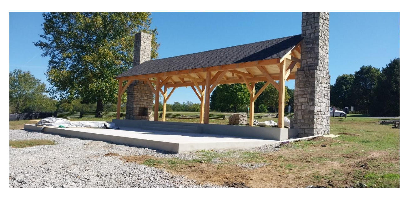
Patio Poured, Chimneys and Fireplaces Rebuilt, Roof Installed