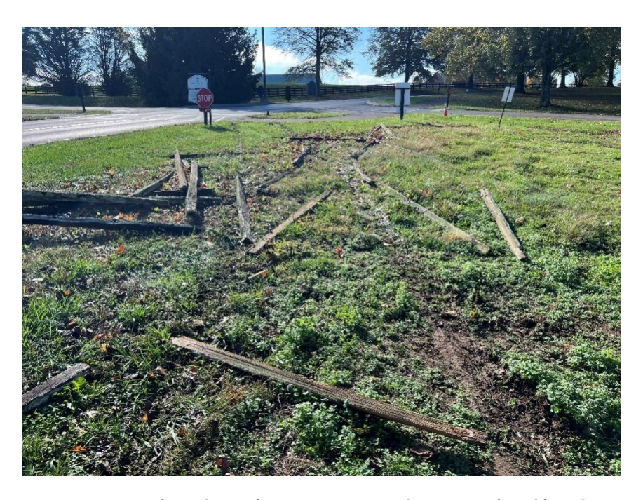
Unknown Vehicle Crashing through the Construction Site, Sept. 10, destroying stop sign but missing the Pavilion by inches