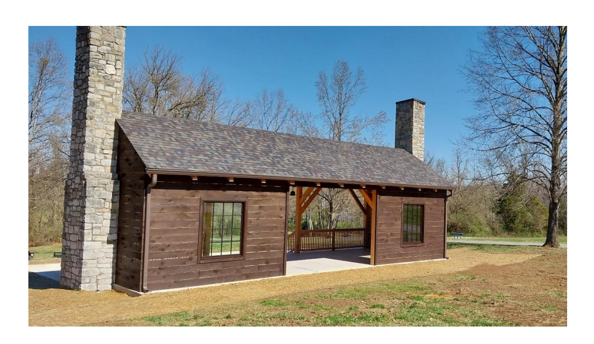
Project Complete, Siding Stained, Grading Done March 15, 2025