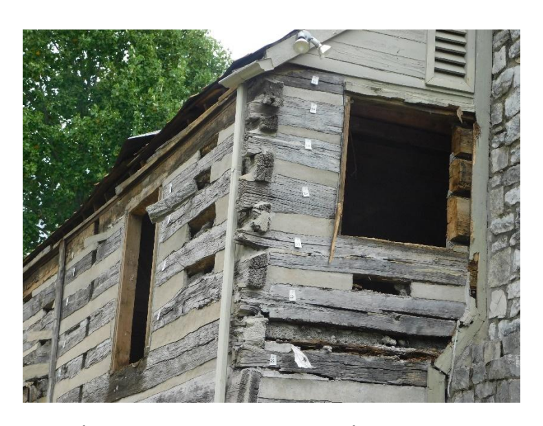
Deteriorated Notches and Rotted Timbers, July 2022