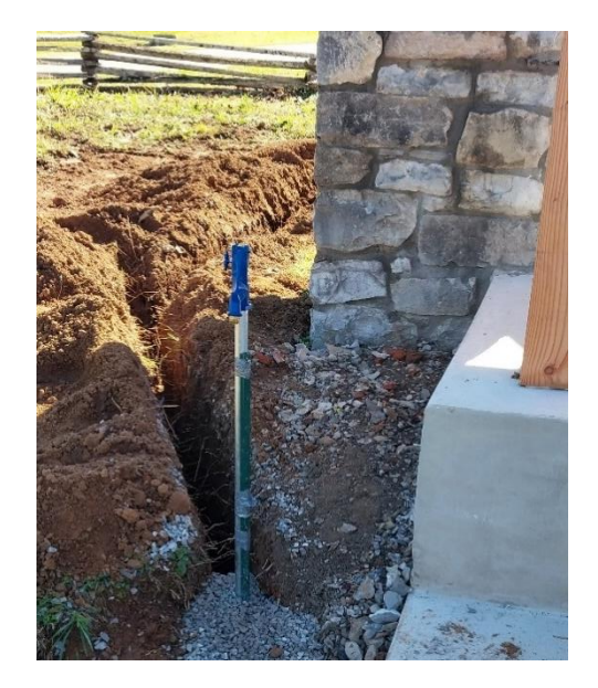
Hose Bibb Installed