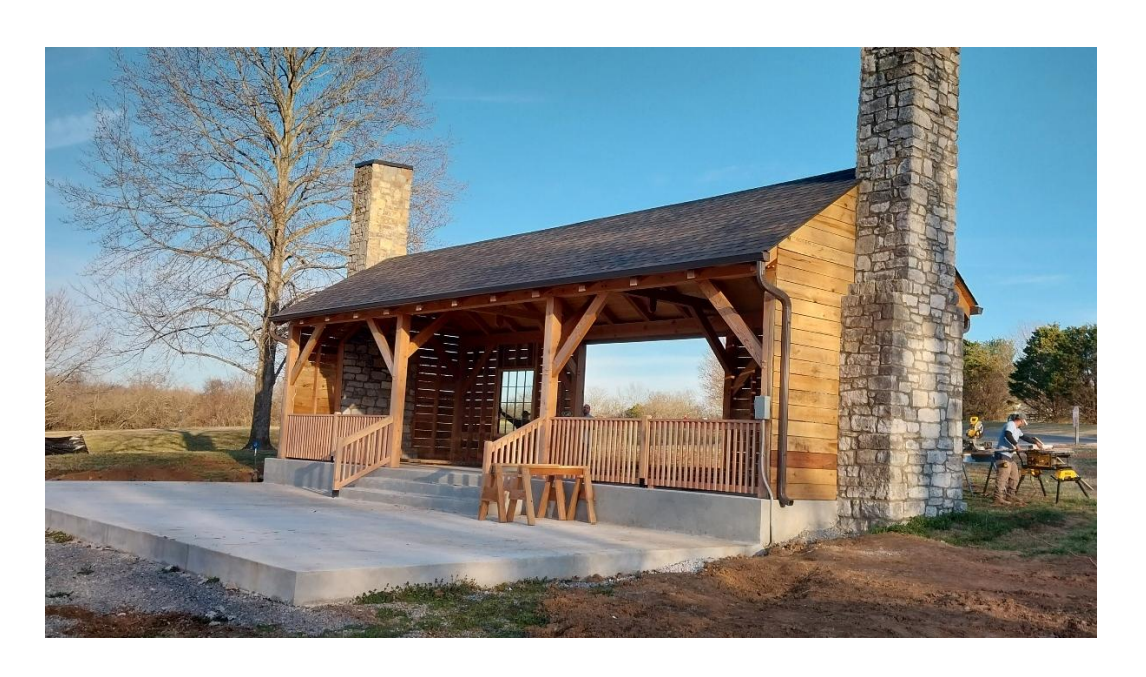
Safety Railing Installed, February 26, 2025