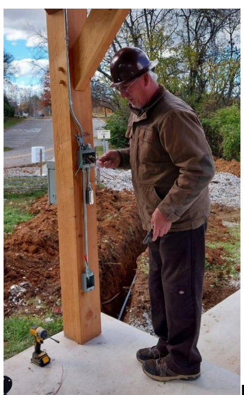
Electrical Service for lights, fans and outlets being installed, November 20. 2024