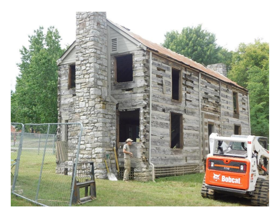
Cabin being deconstructed, 2022