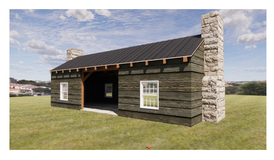
Rendering Submitted to City Commissioners September 2023