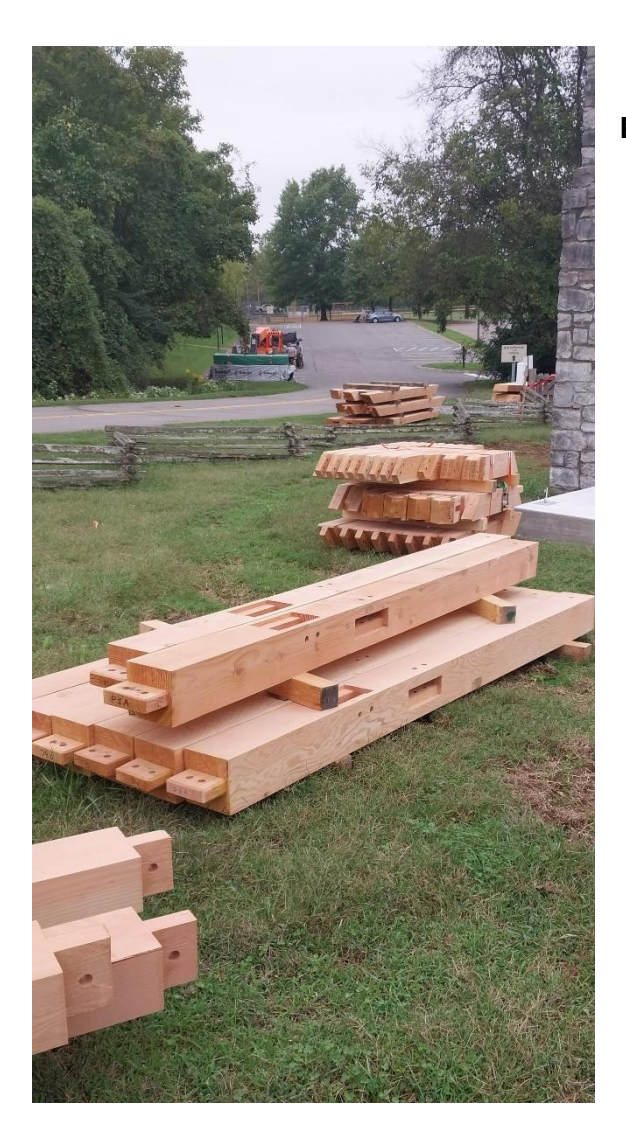
Pavilion Structural Components delivered to site October 2024