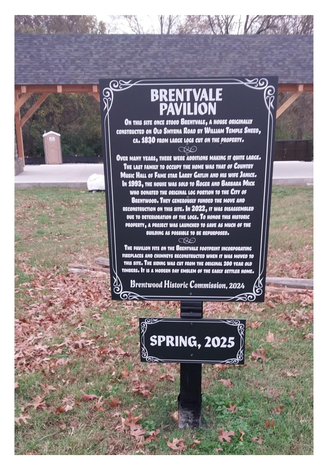
Sign erected November 6, 2024