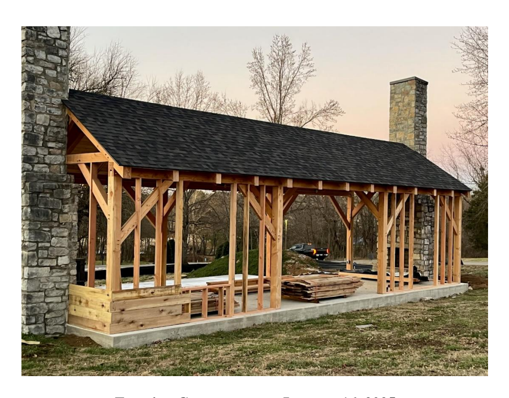
Framing Commences on January 16, 2025