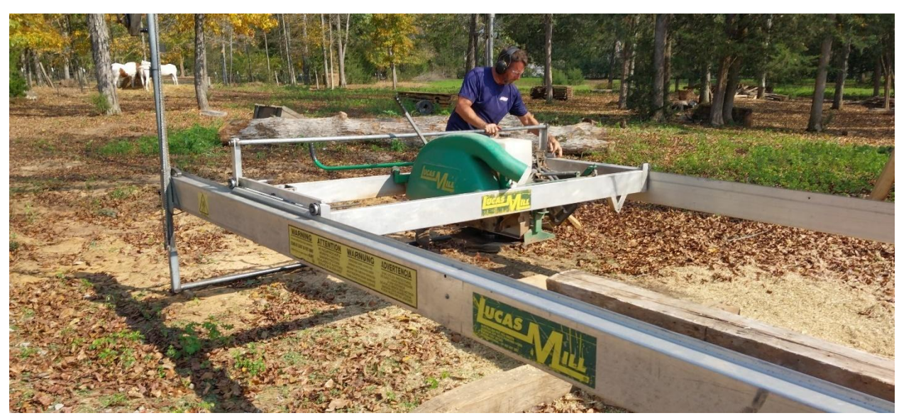
Timbers being sawed into siding