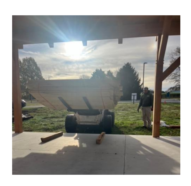
Siding being off-loaded to pavilion Slab