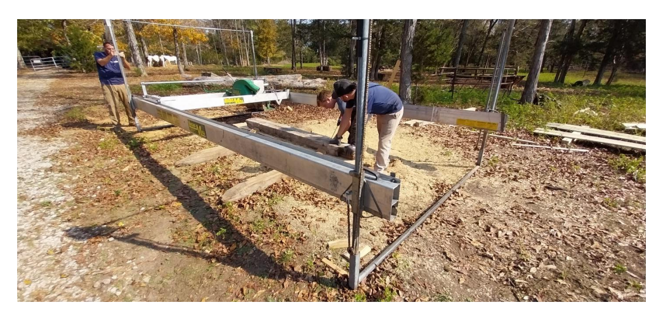
Timbers being sawed into siding, TNTREE, October 29, 2024