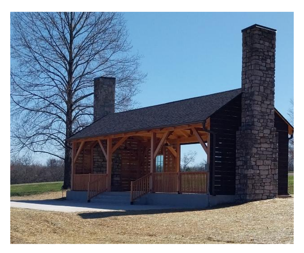
Back of Completed Pavilion