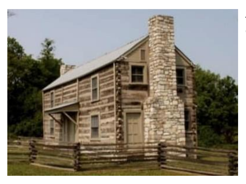
The reconstructed Brentvale Cabin at Crocket Park, 1994