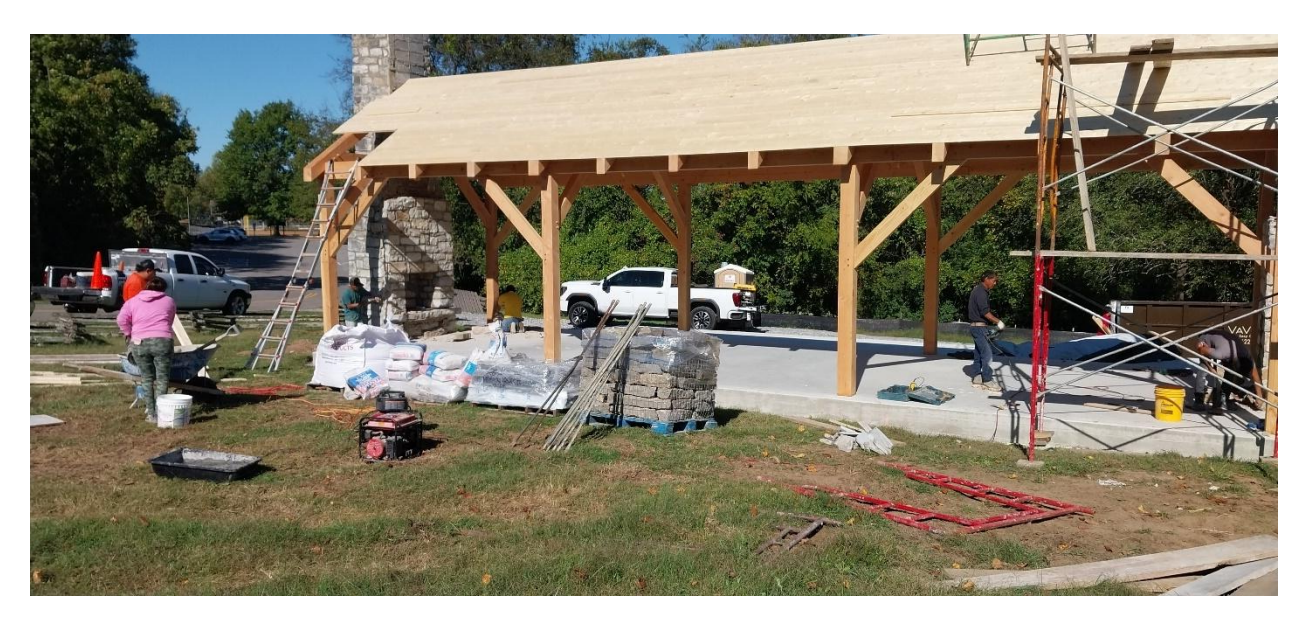
Pavilion Structure erected, roof being installed, chimney masonry repair