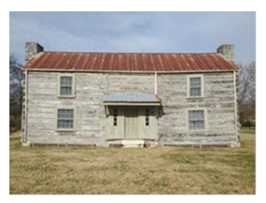
Cabin in 2021