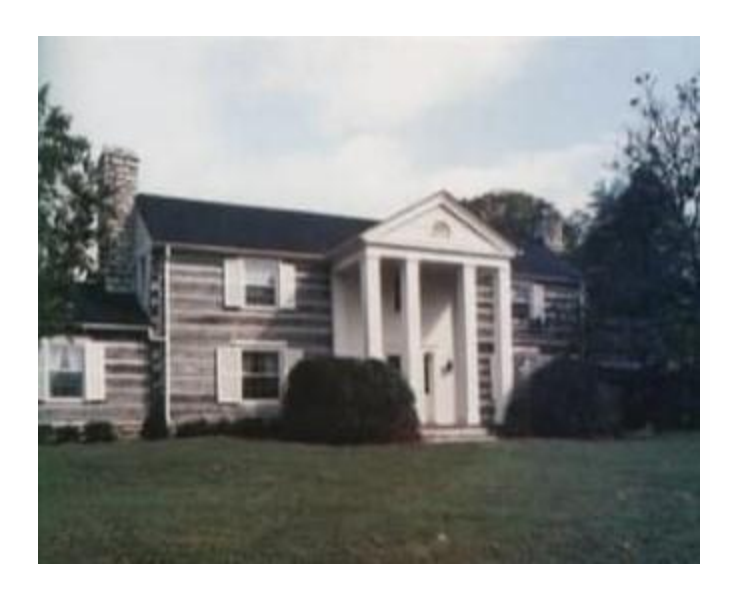
The Brentvale Cabin before being moved to Crocket Park