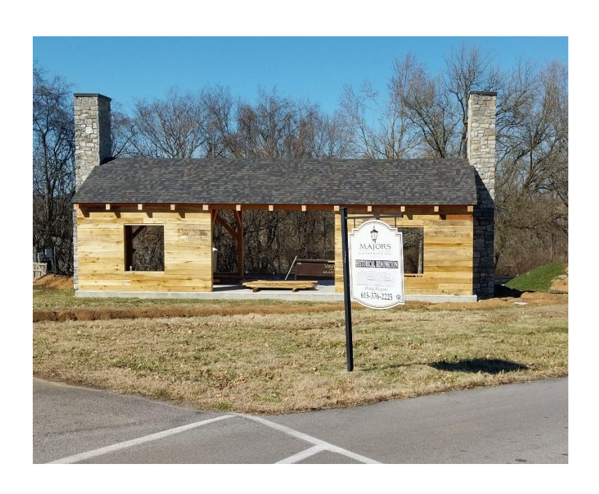
Siding Complete, February 3, 2025