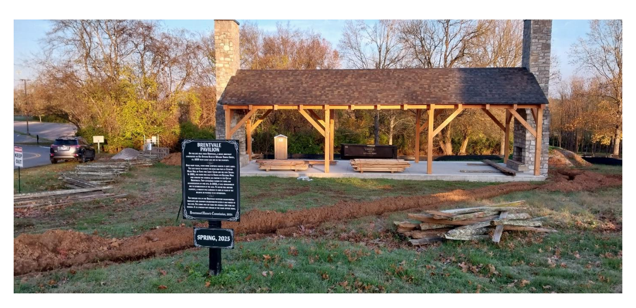
Pavilion ready for framing and siding boards November 23, 2024