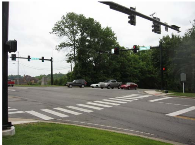
The intersection at Concord Road and Green Hills Blvd. will start the detour route on the west side for the public to travel east through the detour route.