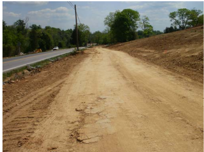
Work on the cut (right side) from Edmondson Pike to Beech Grove Road is underway.