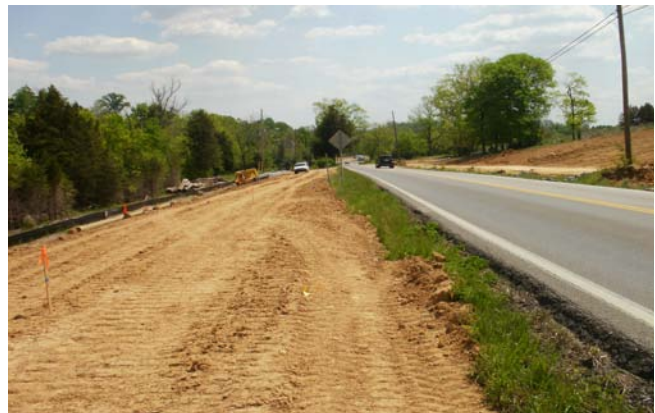
Work on the fill (left side) from Edmondson Pike to Beech Grove Road is underway.